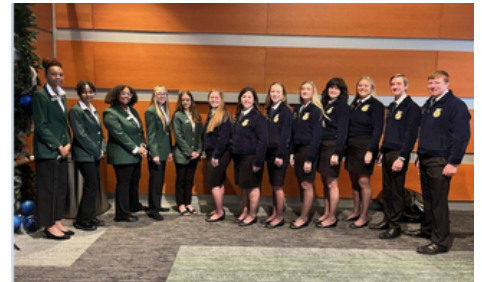
Virginia 4-H Ambassadors and FFA State Officers at the 2023 Farm Bureau Convention.