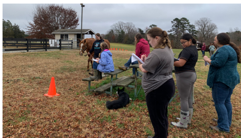
Judging practice at Four Oaks