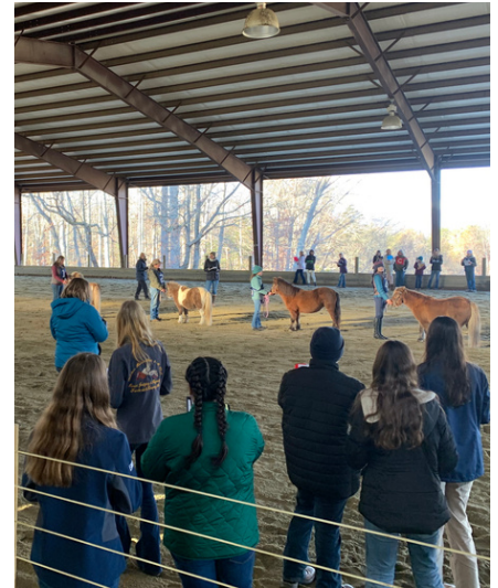
Contestants judging a miniature horse class.